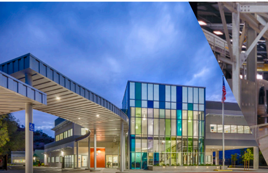
College View School Glendale, CA

Environmental Management Systems ISO 14001